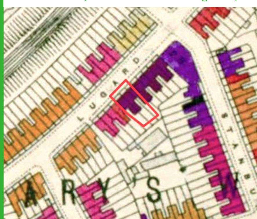
London County Council bomb damage map