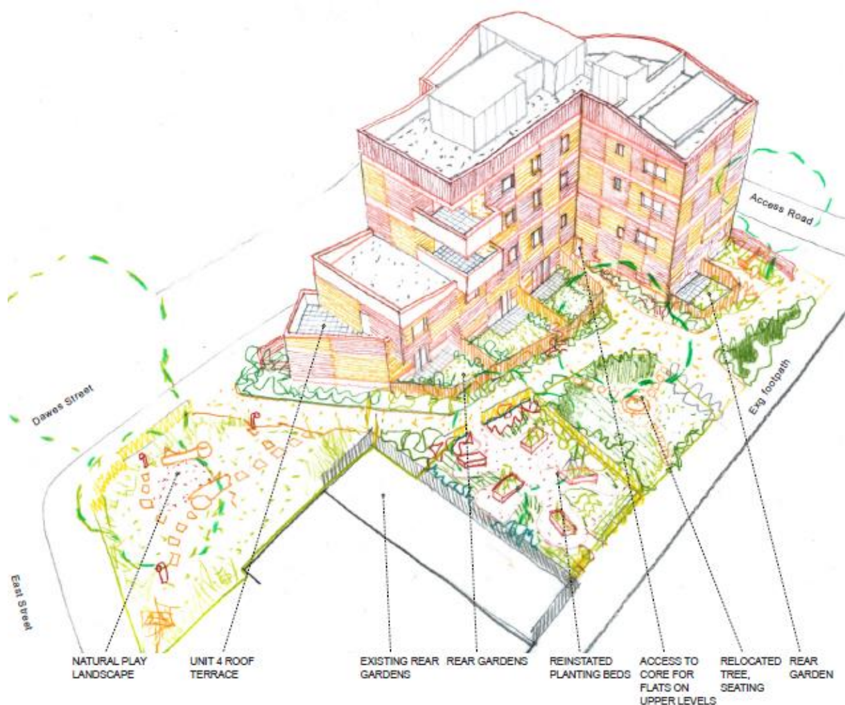
View of proposed courtyard landscape

The drawings below show what the proposed development would look like: