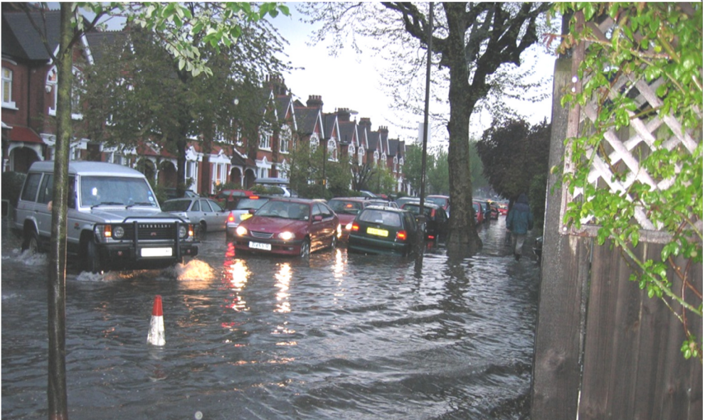
Flooding in Turney Road – April 2004