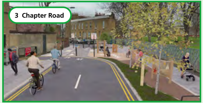
3 Chapter Road