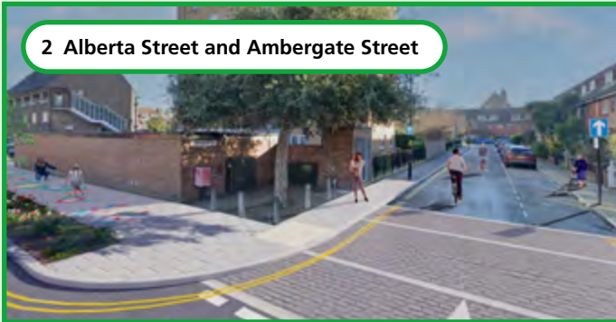
2 Alberta Street and Ambergate Street