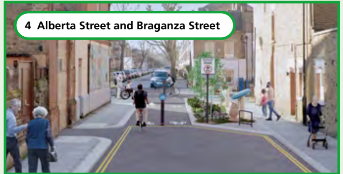
4 Alberta Street and Braganza Street