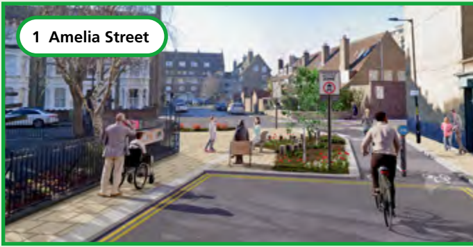
1 Amelia Street