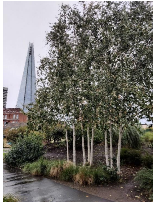
Figure 3-1 Photograph of Silver Birch trees with the Shard building in Southwark

In 2019, Southwark was above the London and England average for percentage of deaths in those aged 30+ due to particulate air pollutions (PM2.5) as stated in the JNSA (2022) . The most significant causes of air pollution in Southwark are from road transport and from domestic / commercial fuels mostly from cooking and heating.