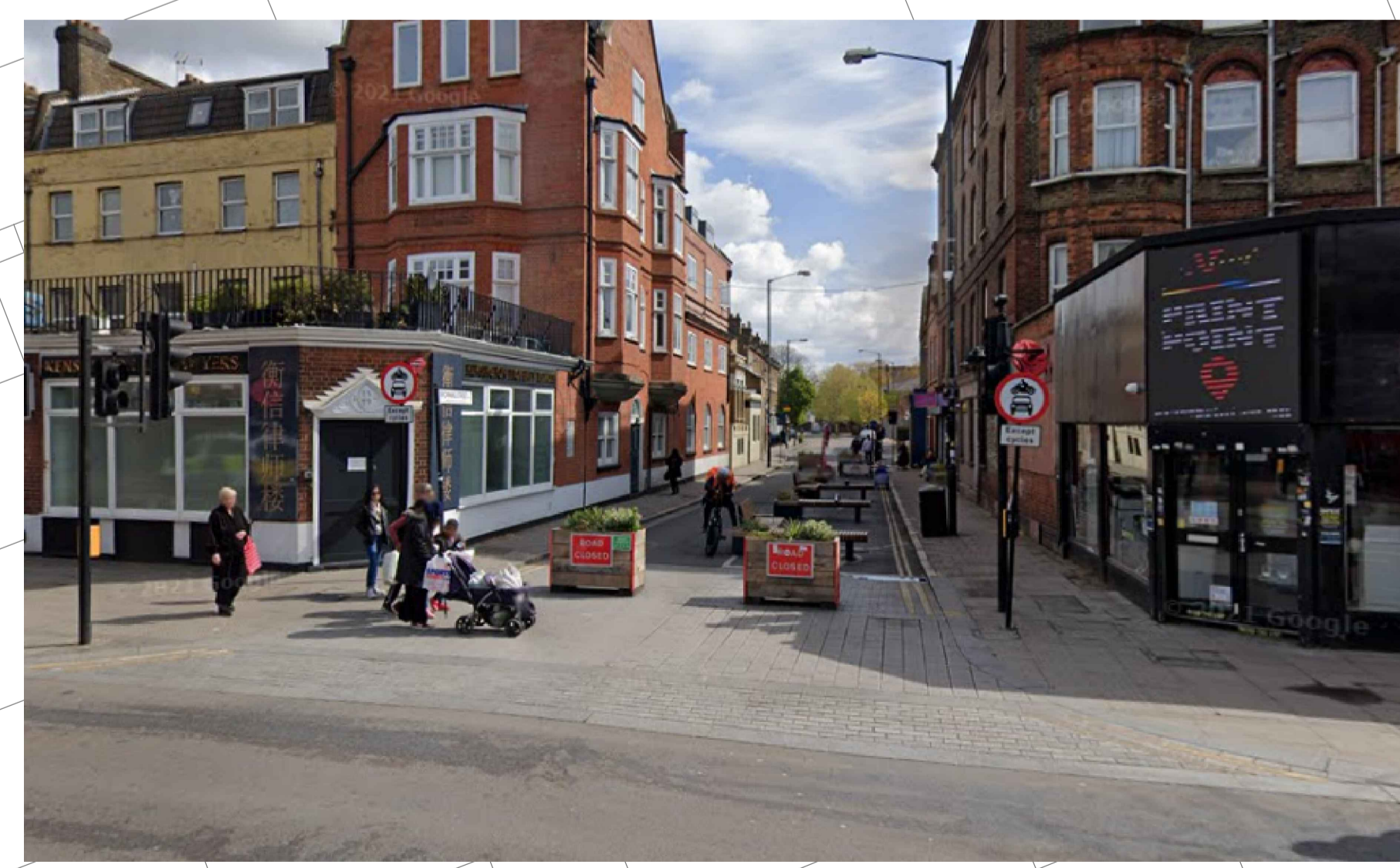
EXISTING LAYOUT AT BROWNING STREET WHEN VIEWED FROM WALWORTH ROAD