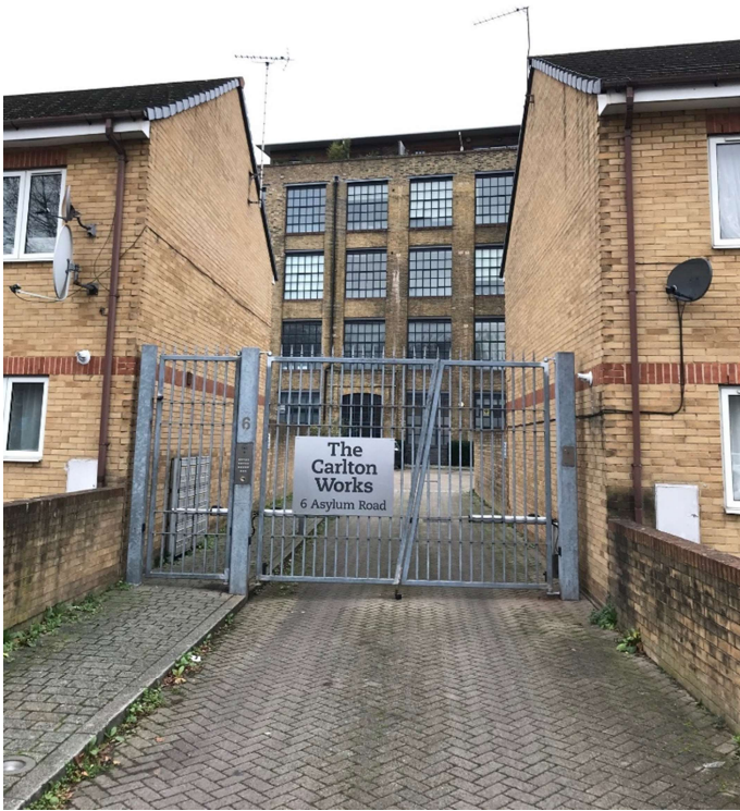
Figure 3 The Carlton Works from Asylum Road.

2.5.4 Historic maps show the construction of housing over the site of Bird in Bush Park continued after 1872; the park site was completely covered by 1896. Maps show housing remained over the area of the park into the 1960s. The park presently contains a fruit orchard, sensory garden and BMX track.