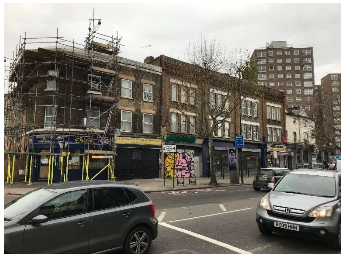
Figure 5 The terrace on the Old Kent Road bookended by Asylum Road and Commercial Way.

3.1.3 The framework of streets and spaces are framed by the course of the River Peck, a significant, but now 'lost' river of south London and the Roman road alignments of Watling Street (Old Kent Road) and the London to Lewes Road (Asylum Road).