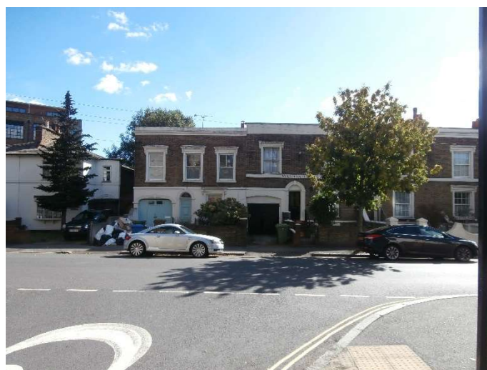
Figure 8 William's Terrace 306-318 Commercial Way

3.4.8 William's Terrace, Nos 306–318, marks a change in the architecture of Commercial Way. This is a continuous terrace of housing of two stories over a half basement with main entrances up steps. There has been some loss of detail within this terrace. Architectural features of the buildings include windows with cornices on consoles to the raised ground and first floor, doorways with arched heads enlivened with keystones and a moulded parapet. The base of the first floor windows is marked by a rendered band running the length of the terrace. A length of the moulded parapet has been lost from No. 318.