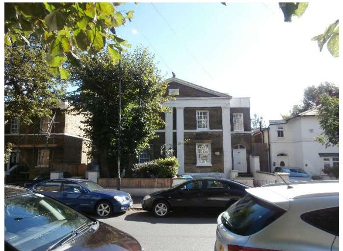
Figure 7 Doddington Cottages, Commercial Way

remains largely in place. Parapets (mainly complete with cornices) hide butterfly roofs behind and again give the terrace a typical late Georgian/ early Victorian flat fronted appearance.