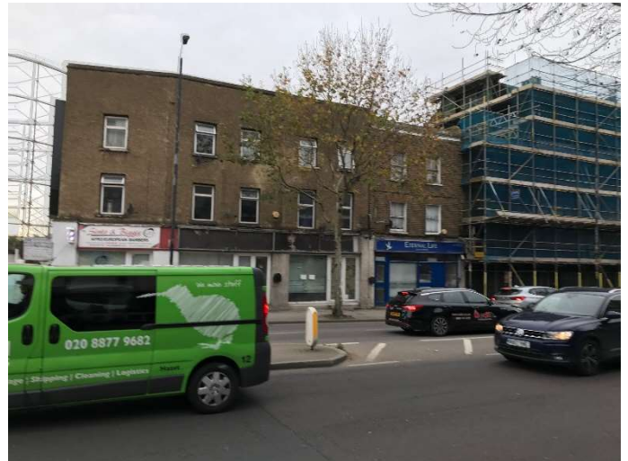
Figure 10 721-729 (odd) Old Kent Road.

3.4.14 Nos 721–729, fronting to the far side of the Old Kent Road represent a surviving terrace of three-storey Georgian buildings, converted to shops. All have been pebble dashed, except for 727–729 that retain their stock brick frontage. 727–729 also retain 19 th -century sash windows and No. 729 has an early 20 th -century shop front.