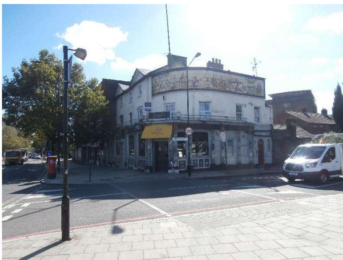
Figure 4 The decorated frontage of the former Kentish Drovers public house.

3.1.1 The Kentish Drovers and Bird in Bush Conservation Area has some historic significance as being one of the Peckham suburbs developed after 1830; Greenwood's map shows the existing buildings on the Old Kent Road and the common field of Peckham laid out with new roads. Later development of industrial buildings and schools tells the story of the development of the wider Old Kent Road area.