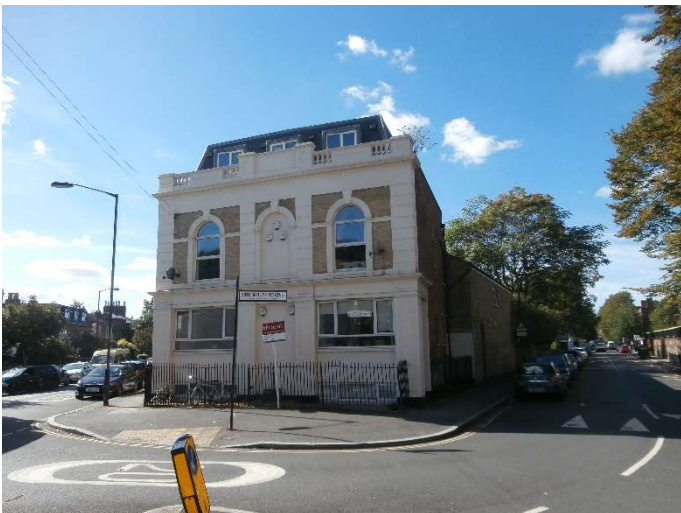
Figure 6 The former Sidmouth Arms public house.

3.2.2 Public houses, such as the Kentish Drovers standing at the junction of Commercial Way, preserve in its name the role of the public house and the Old Kent Road as a route for animals to be bought on their hoof into London for processing as meat. The changes to the public house, into a modern public house, and the former Sidmouth Arms at the junction of Bird in Bush Road and Commercial Way within the Conservation Area reflect the architectural aspirations of builders constructing public houses to support the growing suburb and provide services.