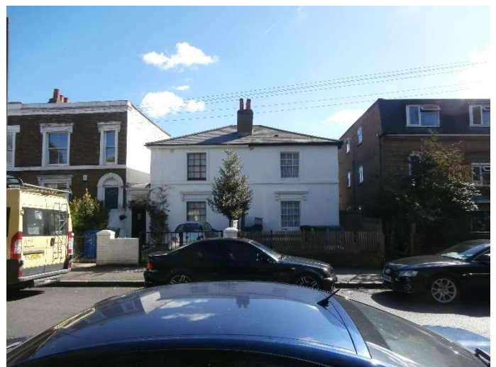
Figure 1 302-304 Commercial Way cottage pair early 19th-century

2.3.3 The growth of Peckham and focus towards the Old Kent Road is a product of the enclosure of the common field shown on Rocque's Map, and the wider improvements to roads and transport in and around London, linking up outlying villages to the economic driver of the metropolis encouraging settlement growth and the development of industry, replacing agriculture. The historic agricultural links of this area are documented by public house names such as the Kentish Drovers. Drovers moved animals on hoof, walking the finished beasts from the farms of Kent to the meat markets and slaughter houses of London.