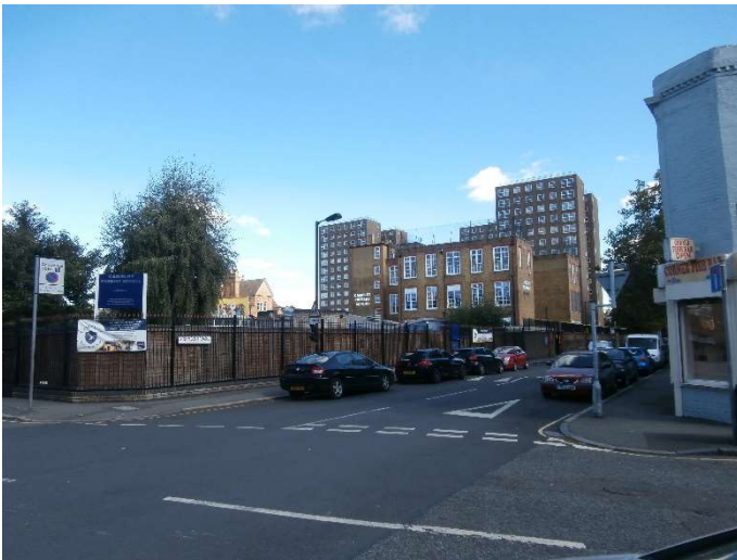
Figure 2 Camelot School and Bird in Bush Road

2.3.6 Much of the development of the conservation area dates from the 1830s–40s, including the establishment of the streets and the construction of the earliest housing. Camelot Primary School is built upon the site of earlier housing.