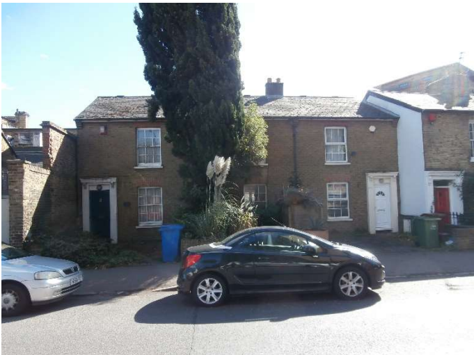
Figure 9 342-346 Commercial Way

3.4.12 Between the Kentish Drovers and Doddington Place is a short run of simple, two-bay, two-storey paired, mirrored terrace houses of brick with render doorcases with consuls supported on corbels. The houses have slate roofs, and centre stacks; the roofs step up in pairs towards Doddington Place. The houses generally preserve their six-over-six sash windows.